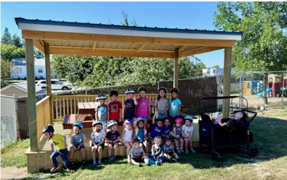
A 2024 grant from the RCEF built this shade structure for the Rolla Community Day Care.