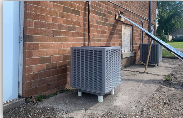
Air conditioning units were installed at the Walla Theatre in late June, with help from a WACF grant.

Grants from the WACF are awarded once a year. Any organization with a 501(c)(3) status or government agency may apply. Applications are available online at www.NDCF.net/Walhalla . ◇