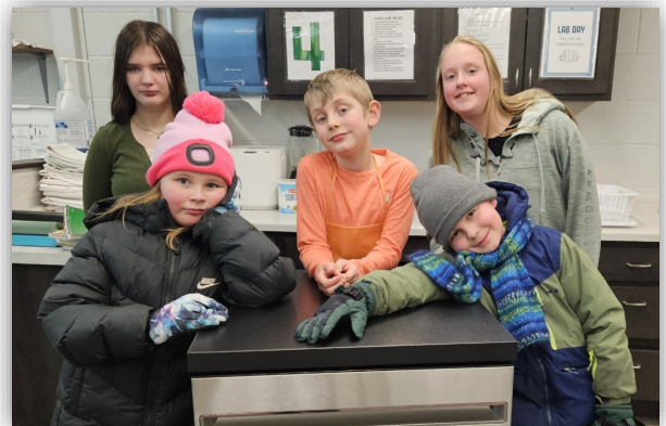
Elementary school students pose with the new dishwasher for their after-school cooking class, bought with a 2025 grant from the DACF.

Grants are awarded once a year and applications are accepted from August 15-September 30. More information and an online application are available at www.NDCF.net/Drayton