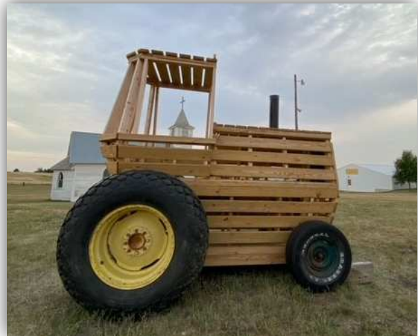
The Hazelton-Moffit-Braddock's first grant helped fund this new piece of playground equipment at the Threshing Grounds north of Braddock.

Grant applications are accepted once a year and are due by May 31. Go to www.NDCF.net/HMB for more info. ◇