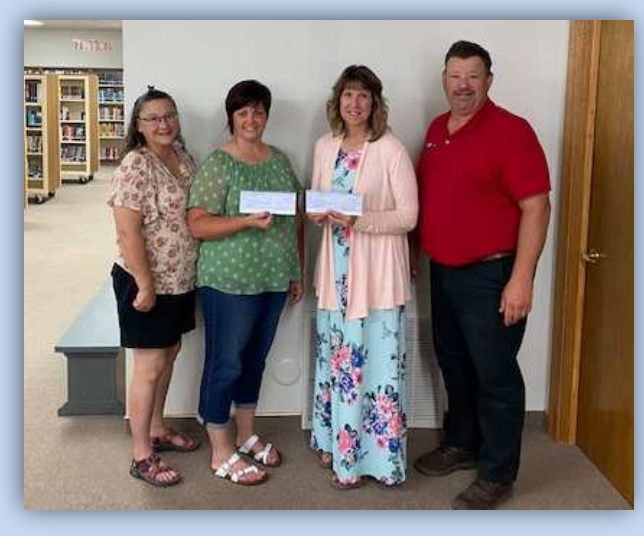
2022 grantee check presentation.

Grant applications are accepted from June1 - June 30 every year. Application forms and information about the process are available online at www.NDCF.net/ GoldenValleyCounty . The Golden Valley County Advisory Committee will discuss applications and recommend grant awards.