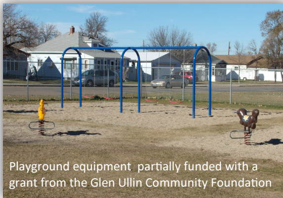
Playground equipment partially funded with a grant from the Glen Ullin Community Foundation