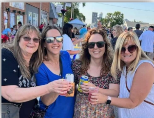
Photos from the Wishek 125th Celebration’s Facebook page.