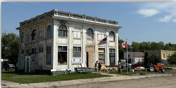
Work continued on the former State Bank of Antler building this past July.

Grants are usually awarded once a year. Any organization with a 501(c)(3) status or government agency may apply. Applications are available online at www.NDCF.net/ SherwoodAntler and due by September 15.