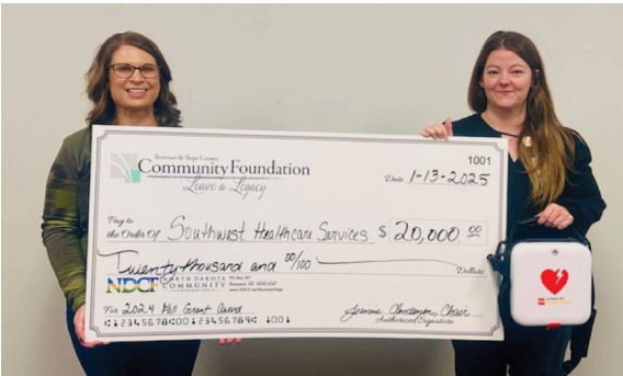
A 2024 grant to Southwest Healthcare Services helped purchase 10 AED units for the area.

There will again be two grant rounds in 2026. More information and an online application is available at www.NDCF.net/BowmanSlope .