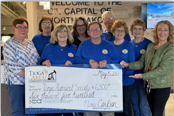
Tioga Historical Society grant award, May 2024

Watch for an announcement soon about our 2025 grants!