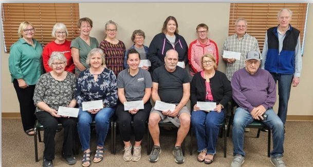
2025 Grant Recipients and Committee Members