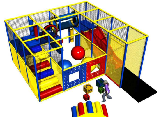
The Carrington Youth Center will use their grant to help fund an indoor playground for kids ages 2-10.

Grants are awarded annually. Any organization with a 501(c)(3) status or government agency may apply. Applications are available online at www.NDCF.net/Carrington.