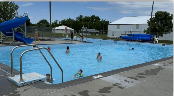
The Drayton Park Board received a grant from the DACF in 2022 to help pay for a new pool liner since the old liner had multiple leaks.