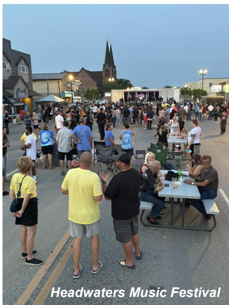
Headwaters Music Festival