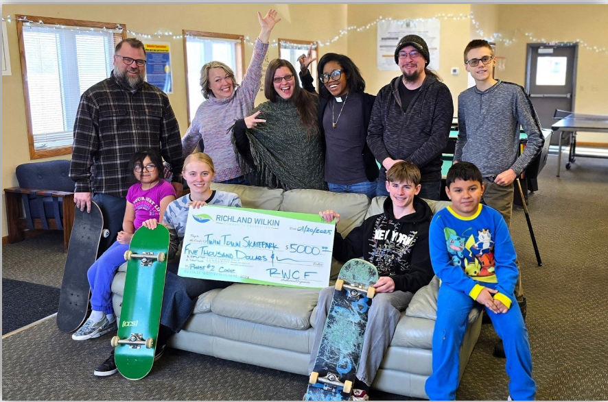
Grant delivery to the Twin Town Skatepark for their second phase of construction at the Breckenridge Family Community Center.