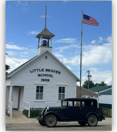
A 2021 grant from the GVCCF to the Golden Valley County Historical Society helped pay to paint the schoolhouse, install gutters, and fix the garage door.

The Fall Grant Round has a deadline of September 30th. Applicants must be a 501(c) (3) nonprofit organization, a government agency, or have a fiscal sponsor with one of those designations, and must provide services in Golden Valley County. Applications are available online at www.NDCF.net/ GoldenValleyCounty.