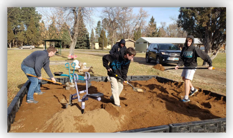
Hebron Hígh School students helped with final work on the new playground equipment in November.