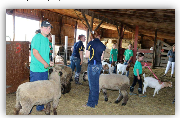
Area youth house livestock in the C.M. Cook Youth Development 4-H and FFA Club Barn as they learn about feeding, caring for, and showing their animal.

Adams County Youth Development Foundation: $640 for supplies/equipment at the C.M. Cook Youth Development 4-H and FFA Club Barn so Club Barn youth can clip and prepare their livestock for shows.