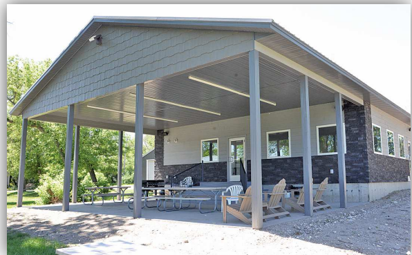
The Prairie Rose Golf Course club house project received a large grant from SACF last year and is almost complete.

Any organization with a 501(c)(3) status or government agency may apply for a grant. Applications are available online at www.NDCF.net/Stanley from August 25 - September 25. ♦