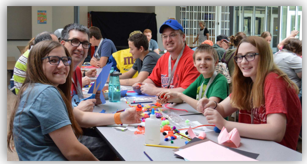
A grant from the Richardton Area Community Foundation helped purchase art supplies for Camp ReCreation's 2019 camp

Grants are awarded once a year. Any organization with a 501(c)(3) status or government agency may apply. Applications are available online at www.NDCF.net/Richardton.