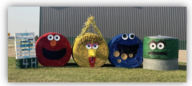
The decorated haybales this fall were amazing and brightened up our town! Thanks to everyone who participated!

If you are interested in applying for a grant, applications are available online at www.NDCF.net/Maddock. Grants are awarded once a year and the deadline is March 31. ◊